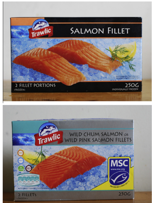
Fig. A1. Frozen salmon fillets. Packages containing two frozen fillet portions from the retailer Lidl's own brand Trawlic. The top is an unlabeled product, while the bottom carries the MSC label in the lower right corner.

Questions about how eco-label premiums are transmitted through the supply chain to the actors who ultimately affect sustainability (fishermen, fish farmers, and fishery managers) highlight a key limitation of the attribute-based approach to price premiums, namely lack of quantity data. Because we do not observe quantities sold, we do not know whether high- or low-premium pricing strategies move more eco-labeled product. Suppose that the high-end retailers sell most of the MSC-labeled salmon and that low-end retailers sell little. Because high-end retailers have the lowest premiums, then the average premium passed through to the harvest sector will be low. The opposite would be true if the low-end retailers sell most of the MSC-labeled salmon. The Alaskan salmon industry's decision would seem most consistent with the former. It could even be the case that retail pricing strategies deliberately discourage the purchase of eco-labeled products; simply including these products in stores and not necessarily selling them would then be part of projecting a positive corporate socially responsible image.