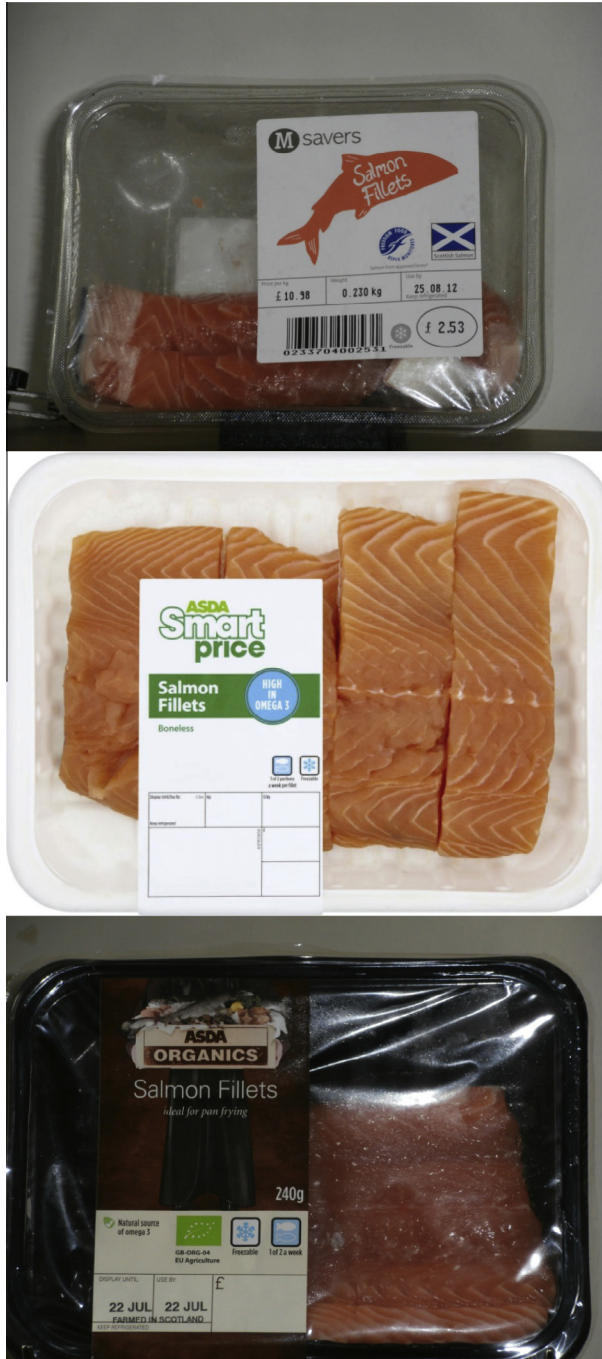
Fig. A2. Fresh salmon fillets. The top image is from Morrisons with a Scottish label in the lower right corner of the main section of the product label. The bottom two images are both from ASDA, one unlabeled (middle) and one with an organic label (bottom).

The role of eco-labels in private provision of public goods is still not well understood. When consumers can choose an impure public good that jointly produces a private good and an environmental public good, welfare can increase or decrease, depending on the responsiveness of consumers to the environmental attribute (Kotchen, 2006). Understanding consumer demand for eco-labels thus is an important step in evaluating the overall potential for markets to provide public goods. Our analysis provides one important piece of this puzzle by illustrating the importance of retailer